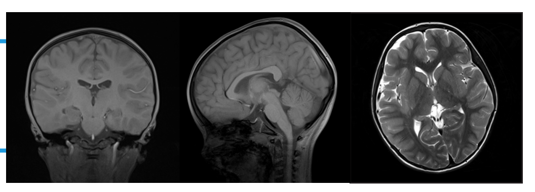
Images of a pediatric brain using the large coild from the Interchangeable Pediatric Brain Coil Set